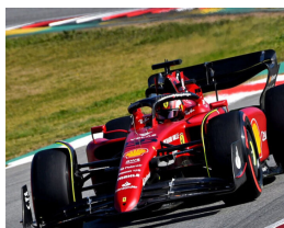
F1 car being driven by Carlos Sainz

The average car has a top speed of around 120 miles per hour. However, there are many other cars that can go faster than that. For example, a Formula 1 car can reach around 200 miles per hour. The reason why it is faster than a normal car is that it has better aerodynamics (which means that the air going past the car doesn't slow the car down as much) and the engine is more powerful. Although 200 miles per hour may seem fast, it is not the fastest that a car can go. An IndyCar can go at speeds around 235 miles per hour. They are fast for the same reasons that F1 cars are fast. However, they still are not the fastest car in the world.