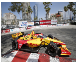
IndyCar being driven By Romain Grosjean

https://racingnews365.com/sainz-claims-ferrari-are-nowhere-near-the-limit-with-new-car