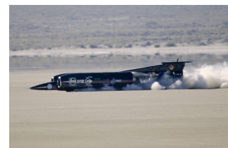
This is the ThrustSSC

https://www.indycar.com/news/2022/04/04-10-grosjean-lb